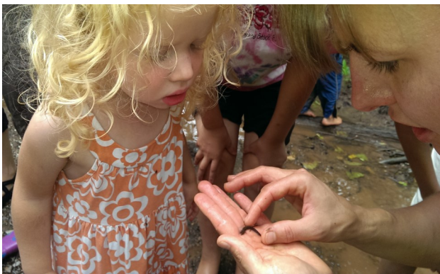
A small salamander was found during this family's F.I.S.H. survey along the Conewago Creek.