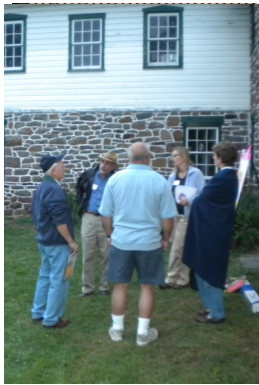
The Conewago Community developed a vision of clean streams, productive farms, and well planned communities.

Funds are available to farmers for conservation in the Conewago. To learn more, contact your local Conservation District.