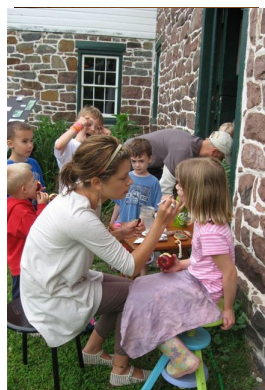
Last year's Earth Day at Aberdeen featured face painting and outdoor fun!

Clockwise, from upper left: Conewago pancake breakfast at Lawn Fire Company, August 2010; Vision Team meeting at Aberdeen Mills, August 2010; A Vision for the Conewago Conference, October 2010; Before and after photos of buffer restoration on Little Conewago Creek; Winter scenes from the watershed.