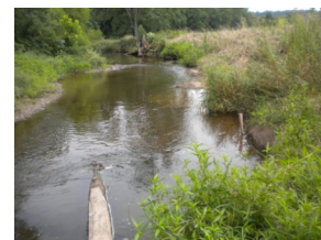
Conewago Creek before (2008) and after (2010) TCCCA stream restoration project.