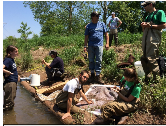
Students from Juniata College and Penn State analyzing samples