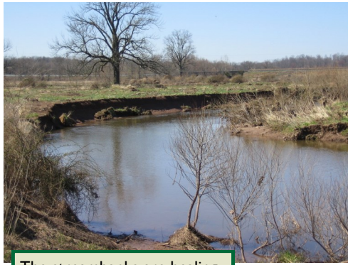
The streambanks are healing and trees are growing tall.

The data collected is still being analyzed, but some preliminary results should be available and posted to our website by next week. Regardless of the results shown, it is easy to see the changes in the streambank, the growth of the riparian buffer, and the abundance of wildlife—all positive improvements!